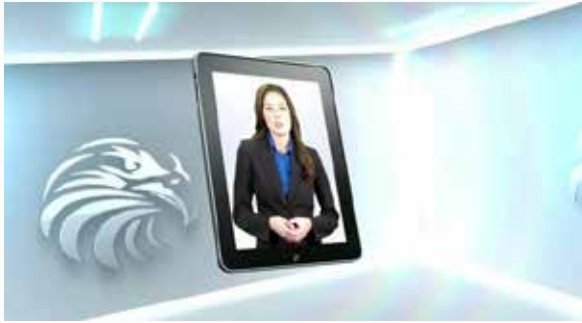
This is the actual thumbnail for one of our videos on YouTube (the thumbnail is generated by YouTube).

our website. Which one would you be more inclined to click and watch?