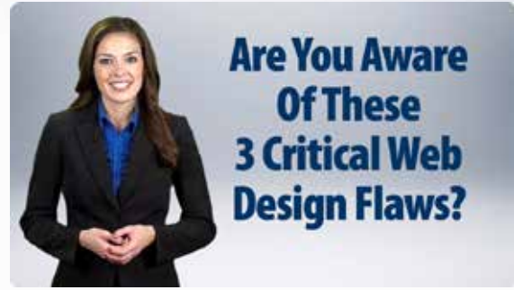
This is the EXACT SAME video hosted on our website with a customized thumbnail. (Yes, it has rounded corners on the video.)

At On Demand Marketing Consultants, we host our client's videos for them and triple encode all of our videos for our clients so that they play back seamlessly in HD (high definition), SD (standard definition), and on mobile devices without forcing visitors to leave the page. And yes, they work perfectly on iPads and iPhones, everytime—even when streaming over cellular networks. Additionally, we always custom create a video thumbnail so that visitors to your website will want to push play and actually watch your video.